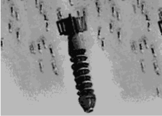
Bomb! No they are mines

Today is your big day. If you can beat the fastest robot in the IRQ2003 land, you'd be free. These robots are intelligent. However, they have not been able to overcome a major deficiency in their physical design — they can only move in 4 directions: F orward, B ackward, U pward and D ownward. And they take 1 unit time to travel 1 unit distance. As you have got only one chance, you're planning it thoroughly. The robots have left one of the fastest robot to guard you. You'd need to program another robot which would carry you through the rugged terrain. A crucial part of your plan requires you to find the how much time the guard robot would need to reach your destination. If you can beat him, you're through.