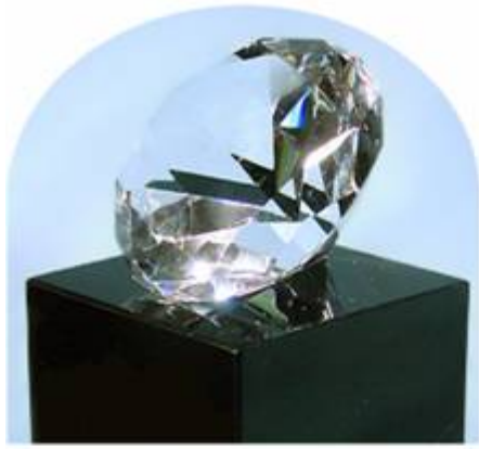
Figure 1: Diamond - A beautiful and precious crystal of Carbon

A scientist is trying hard to make a very large crystal, a large crystal of Carbon to be specific. He believes, as Diamond is a crystal of Carbon and very precious, so his new crystal of carbon would be as precious as Diamond in the long run. The atoms in his crystal will not hold together naturally, so he wants to put a strong force at the center of the crystal, which will attract all the carbon atoms and keep them together.