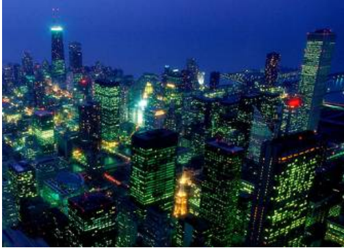
Figure 1: High-rise buildings of Euphoria

So the government of Euphoria now decides to make a new tax rule which will be less (or not) understood by common people and hence it will have less chance of being manipulated. In the new rule, tax depends on the number of high rise buildings in the city and their orientation. Any three high rise building makes Bermuda block in the city and the tax depends on average number of high rise buildings per Bermuda block.