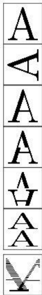
Figure 1: Transformations of image ( a_i^j ) into image ( b_i^j )

mix , row mix. Rows 2k and 2k+1 are interleaved. The pixels of row 2k in the new image are a_{2k}^0, a_{2k+1}^0, a_{2k}^1, a_{2k+1}^1, \dots, a_{2k}^{n/2-1}, a_{2k+1}^{n/2-1} , while the pixels of row 2k+1 in the new image are a_{2k}^{n/2}, a_{2k+1}^{n/2}, a_{2k}^{n/2+1}, a_{2k+1}^{n/2+1}, \dots, a_{2k}^{n-1}, a_{2k+1}^{n-1} .