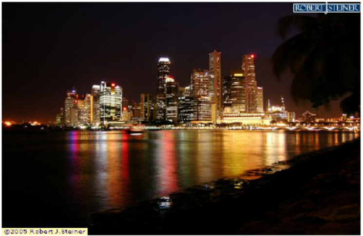
Skyline of Singapore at Night

The skyline formed by the first k buildings is the union of the rectangles of the first k buildings (see Figure 4). The overlap of a building, b_i , is defined as the total horizontal length of the parts of b_i , whose height is greater than or equal to the skyline behind it. This is equivalent to the total horizontal length of parts of the skyline behind b_i which has a height that is less than or equal to h_i , where h_i is the height of building b_i . You may assume that initially the skyline has height zero everywhere.