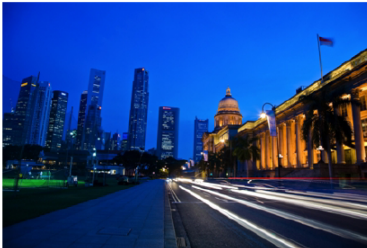
Saint Andrew's Road, part of the Formula One circuit (Kenny Pek, Piccom)

The authorities would like to deploy a new vehicle monitoring system in order to catch these illegal Saint Andrew's Road, part of the Formula One circuit (Kenny Pek, Piccom) number of cameras mounted along various roads. For the system to be effective, there should be at least one camera along each of the possible circuits.