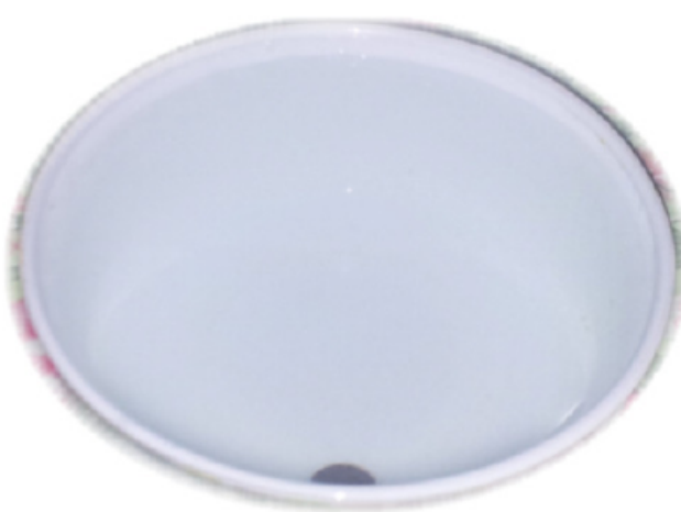
The bowl is filled with water and a part of the coin is visible