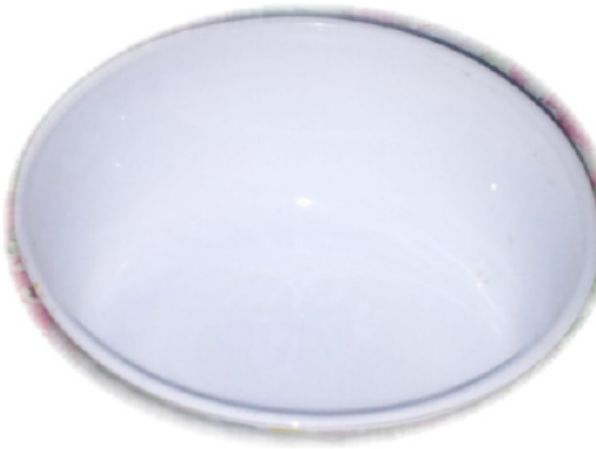
The empty bowl and the coin is not visible

We all know the common test of refraction of light with the visibility of a coin kept at the bottom of a bowl or cup. From a certain position the coin is not visible, but if we pour water into the bowl or cup